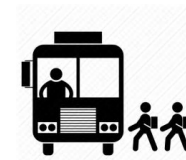
Bus or Transit